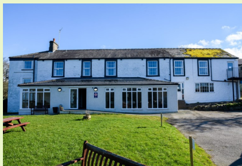
Ingleton Youth Hostel

THANK YOU to all those parents who attended yesterday's meeting about June's Year 5 and Year 6 Ingleton Residential.